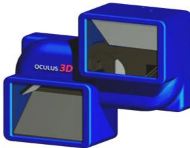
The OculR attachment

Oculus 3D announces a superb quality, easy to install and use, 35mm polarized light stereoscopic 3D film system based on a unique format and projection lens 1 , the OculR™.